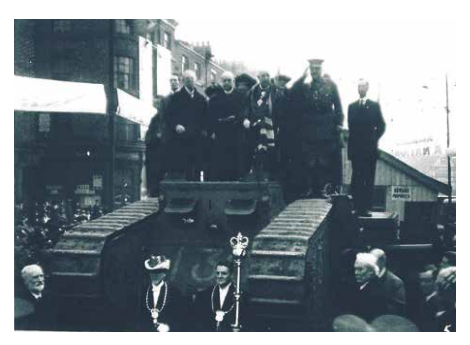
The tank Nelson in Parliament Street

factories, to make cordite, an ingredient in explosive shells and bullets. The conkers were sent by train to top-secret factories at Holton Heath in Dorset and King's Lynn in Norfolk. Around 3,000 tons of conkers were collected by Britain's children in 1917. The plan wasn't a great success. Conkers were a poor source of acetone, the chemical needed to make cordite. In the end, piles of unused conkers were just left to rot. The following year children collected fruit stones and nut shells for use in the manufacture of gas masks.