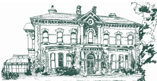
Nunthorpe Hall, demolished 1977