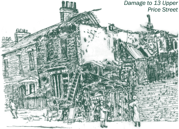
Damage to 13 Upper Price Street

A t approximately 10.30 pm on 2 May 1916 – a starlit night – the Zeppelin Airship L21, commanded by Kapitanleutnant der Reserve Max Dietrich, bombed York. It approached over the Knavesmire, emitting an eerie drone. Jack Kirby, 230 Bishopthorpe Road, wrote: 'The Zepp had passed clean over our house and branched off at an increased rate over the Rectory. The next we heard were three awful dull bangs which shook all the doors and windows very badly. These were quickly followed by four more and these by a lot more. Each bang absolutely shook the house.'